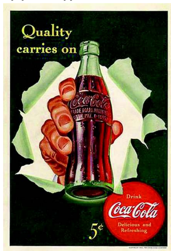
Beverages containing artificial components are a strain for the body. In addition they all lead to dehydration, and diseases such as diabetes and hypertension.

Taking antihistamines on a constant basis will cause more disease, because when you don't honour histamine for what it needs—water, and the minerals and food—and you give it anti-histamine, you're only camouflaging the need, but you're not satisfying the need, and so the disease will continue on. All of a sudden it breaks barriers, and then you develop cancers, you develop all sorts of things, and very quickly one can die. All these people who went to the most expensive clinics, spent thousands of dollars, were given a clean bill of health, they came out of the hospital and ten days later collapsed on the steps of their office or wherever and died, because blood tests never revealed dehydration, which is the foundation of the disease.