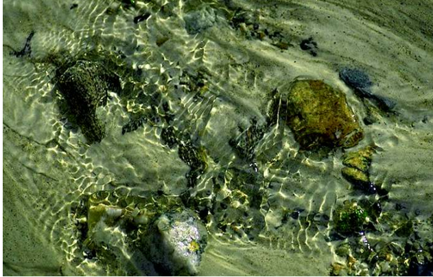
Natural water is essential for our body to function smoothly!

dehydration. Anyone who is waiting to get dry mouth in order to drink water, or waiting to get thirsty in order to drink water, is inviting trouble. In fact, I wrote an article which was published in "Townsend Letters for Doctors," it's a two-page article responding to Heinz Valtin of Dartmouth College who said people shouldn't drink water just like that,