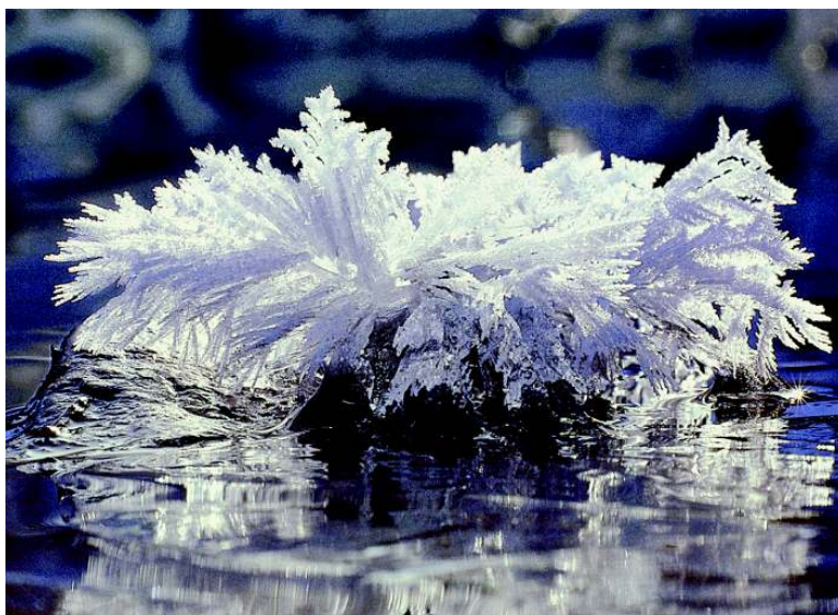
The crystalline world of water in ever changing new forms, carries in its natural state of perfection the vital pattern for our health—physically and spiritually.

histamine, salt is a strong natural anti-histamine. It prevents cramps. The structure of bones depends on salt for fullness, because 27 percent of the salt reserve in the body is in crystallized form in the actual bone structure, in the shaft of the bone. And low salt diets actually cause osteoporosis, not calcium deficiency.