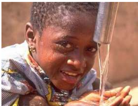
Think about how much you need water. There is nothing like it on the Planet. What would you do without it?

There are two oceans of water in the body—one ocean of water is in the cells, and then there is the ocean of water outside the cells. Water that we drink goes through the cell membrane and replenishes the ocean inside. The salt that we take regulates the volume of the ocean outside. And these two oceans have to be in balance. You cannot fill up the Atlantic more than it is full already and let the Pacific dry up, or fill the Pacific and let the Atlantic dry up, you have to fill them both. And that's why God created connections between all the oceans, in order to balance the oceans. We also have to balance the oceans of water in the body. In fact, the design of the body is that it automatically balances these oceans by certain mechanisms. So, water and salt are vital elements in the human body. Water diffuses through the cell membrane at a rate of 10^{-3} centimeters per second, which is a very fast rate of transfer of water into the cell. In a well-hydrated cell membrane there is a channel between the two layers of the membrane. All the enzymes travel in that channel and meet their counterpart. And they call this a lateral diffusion of